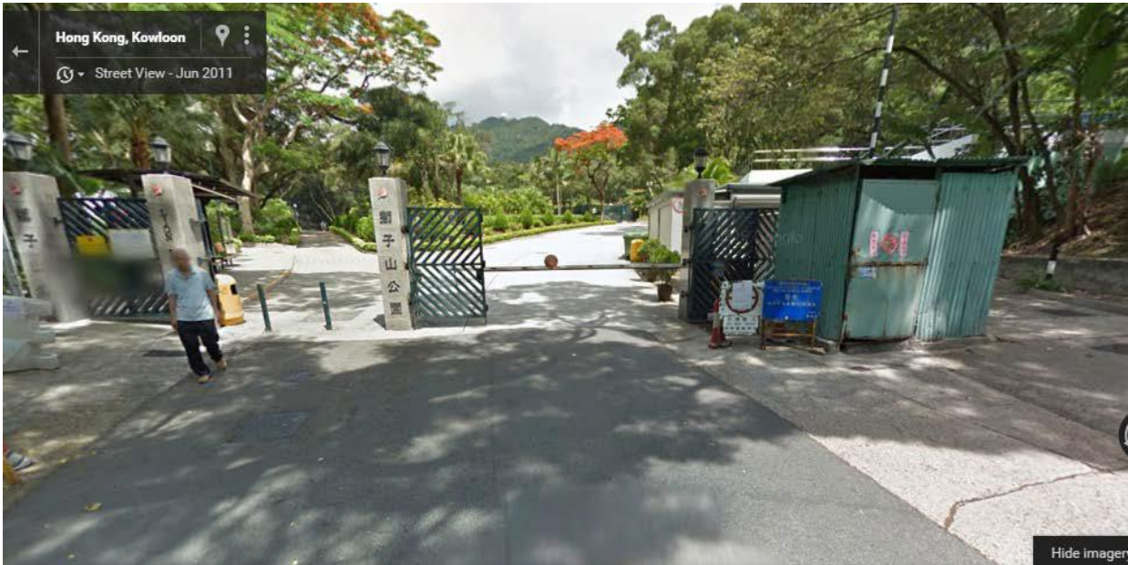
1 Gathering Point: Entrance of Lion Rock Park (獅子山公園入口)